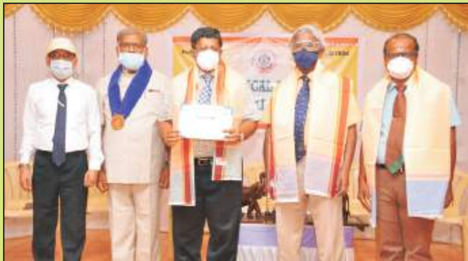
CME on Newer Antihypertensives : Pros and Cons - 10.04.2021

12th May - International Nurses Day | 15th May - International Day of Families 17th May - World Hypertension Day | 19th May - World Hepatitis Day 27th May to 7th June - Child Protection Week | 31st May - World No Tobacco Day