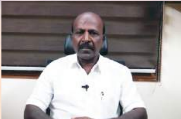
Tamil Nadu Health Minister Honourable Thiru. M. Subramanian