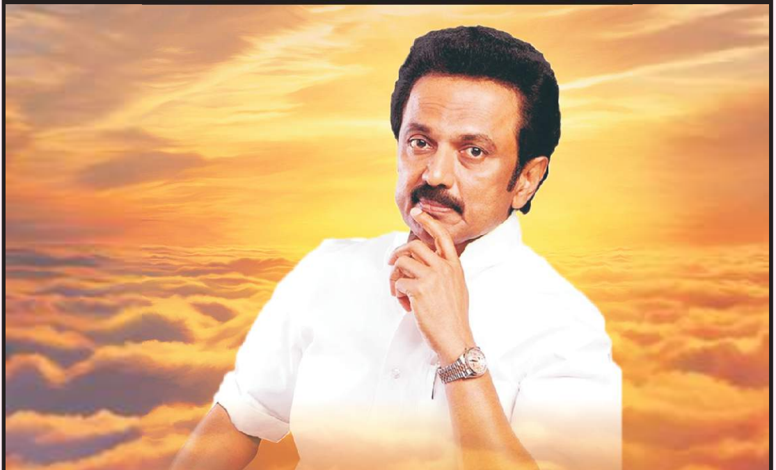
Tamil Nadu Chief Minister Honourable Thiru. M.K. Stalin