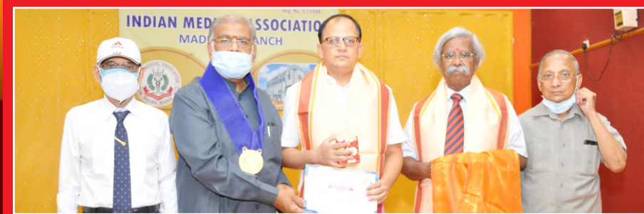
CME - WORLD MENTAL HEALTH DAY - 08.10.2021

21st November - World day of remembrance for road traffic victims 25th November - International Day for elimination of violence against women