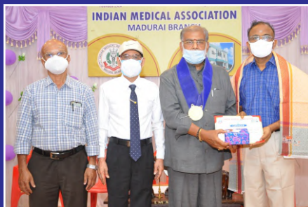
CME - NEUROLOGY (22.10.2021)