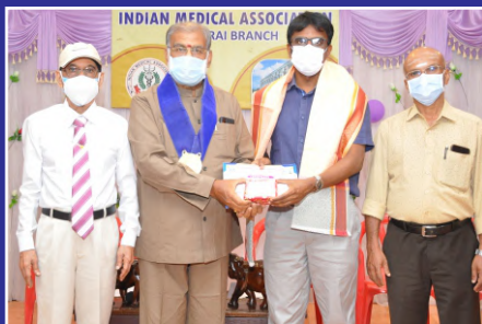
CME - ENDOCRINOLOGY (27.10.2021)