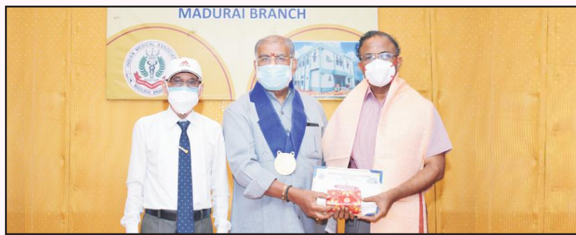
C.M.E. on "BELL'S PALSY" - 17.09.2021