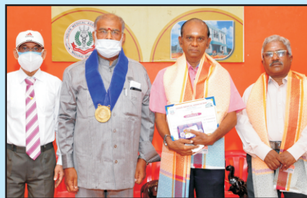
CME - In Pneumococcal Diseases Prevention - What is New

22nd Sep - World Rose Day - Welfare of Cancer Patients 26th Sep - World Deafness Day | 28th Sep - World Rabies Day | 30th Sep - World Heart Day