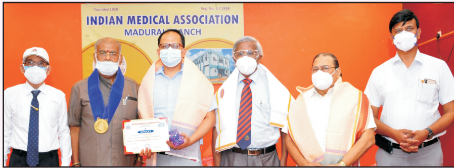
CME - Common Psychiatric Problems - During Covid & Post Covid - 13.8.2021

7th Sep to 14th Sep - National Heart Week | 8th Sep - World Literacy Day 10th Sep - World Suicide Prevention Day & World First Aid Day (Second Saturday of September) 12th Sep - National Leprosy Day | 21st Sep - World Alzheimer's Day