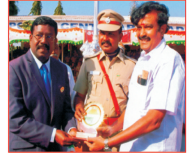
நான்காம் முறை அரசு விருது