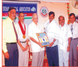
மதுரை I.M.A. யில் கௌரவம்