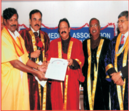
சென்னை-கௌரவ டாக்டர் பட்டம்